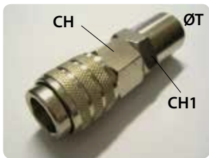
Giunto gigante portagomma Giant quick coupler for rubber hose Schlauchtulle Riesenkupplungen