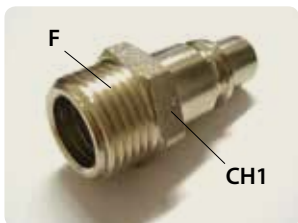
Innesto maschio gigante Giant male plug Riesenkupplungen