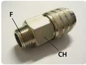
Giunto gigante maschio Giant male quick coupler Riesenkupplungen