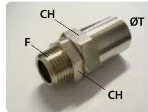
Portagomma maschio gigante Giant male joint rubber tube Riesenschlauchtulle