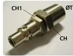
Innesto portagomma gigante Giant quick plug for rubber hose Schlauchtulle Riesenkupplungen