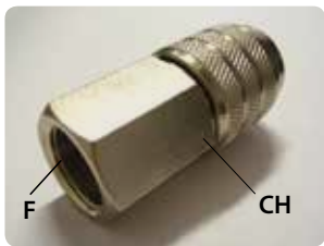
Giunto gigante femmina Giant female quick coupler Riesenkupplungen